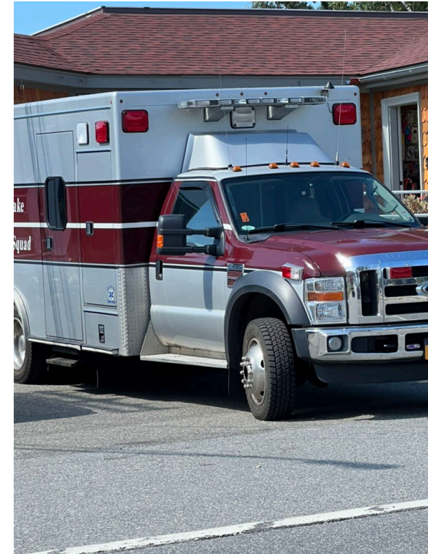
Local EMS & Fire Depts