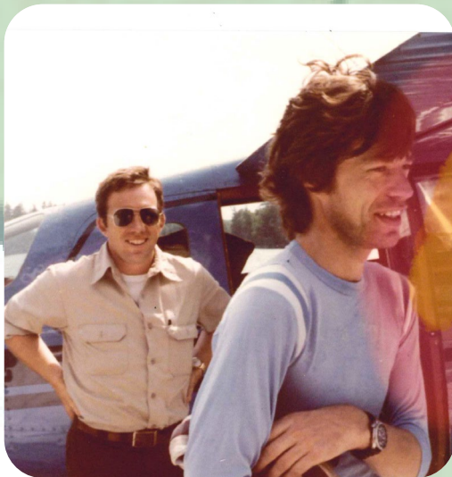
Mick Jagger in Long Lake